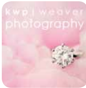
Front Page Featured Photographer Rotating Listing